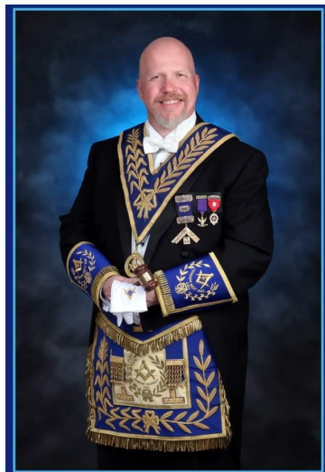
LONDON WEST DISTRICT DEPUTY GRAND MASTER